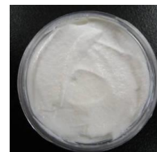
Powdery Matte Mousse