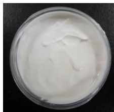
Superior Smooth Cream