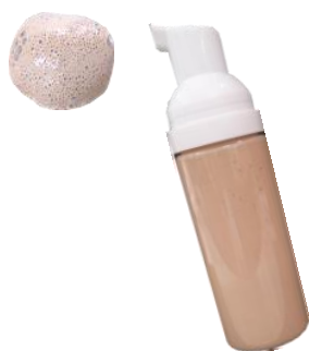
DL/112 Water Mousse Foundation

DL/070 O/W Liquid Foundation DL/112 Watery Mousse Foundation